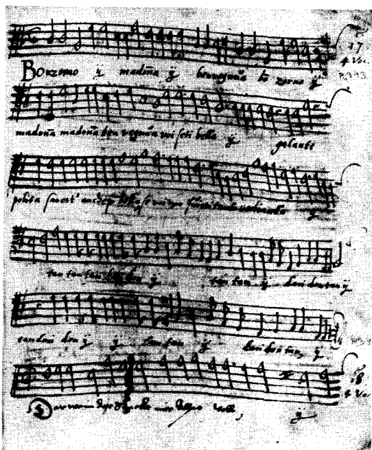
III. 4. Page from a manuscript from the Herlufsholm collection written in mensural notation, which in the beginning gave minor difficulties for the encoding of group 32.