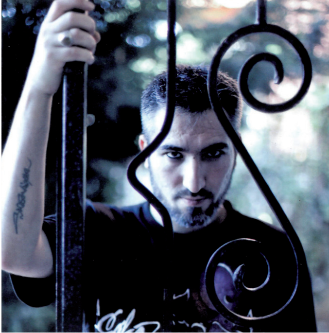
Figure 1: Turkish rapper and DJ Yunus Özyavuz, aka DJ Mic Check, aka Sagopa Kajmer.